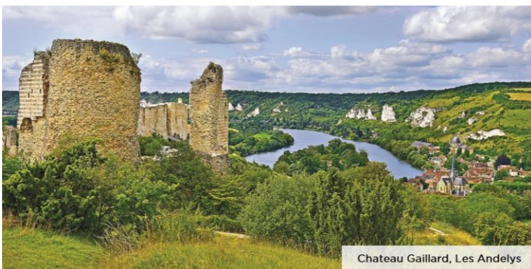
Chateau Gaillard, Les Andelys