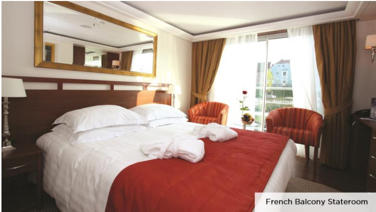
French Balcony Stateroom

7-night cruise | May 23-30, 2024 | Aboard AmaLyra